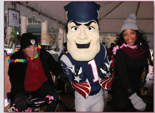
Last year's iCycle Event was a great success. We hope you'll join us this year to help Home Start!